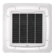
Cover PB-950HE4 (option)